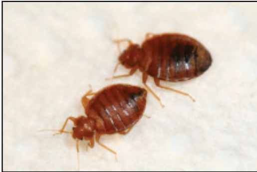
Adult bed bug (¼ inch in length).