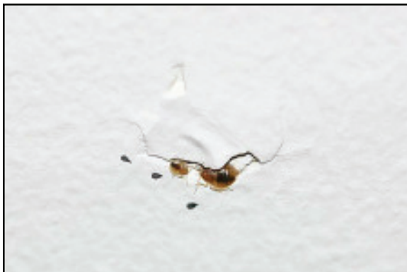
Bed bugs and fecal spots under paint chip on wall.