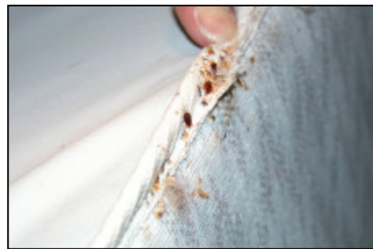
Bed bugs, nymphs, and fecal spotting on box springs seam (headboard end).