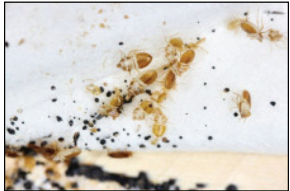
Cast skins on box springs (shell left behind from bed bugs molting into larger stage).