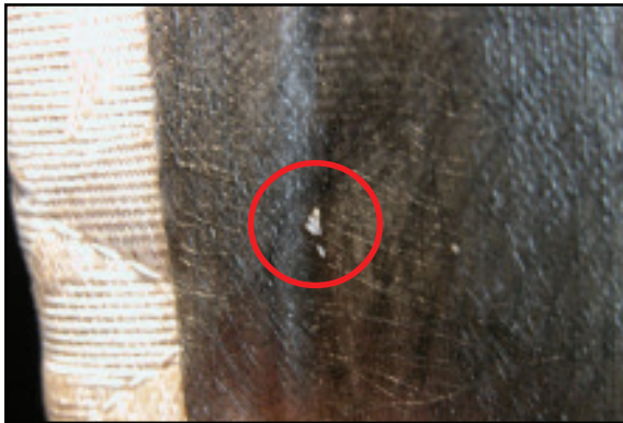
Bed bug eggs on underside of box springs dust cover.