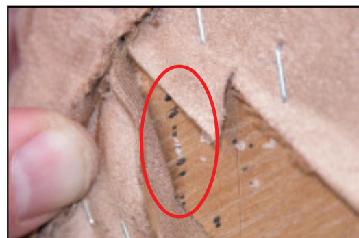
Bed bugs, fecal spots, and eggs (white dots) on back of upholstered headboard.