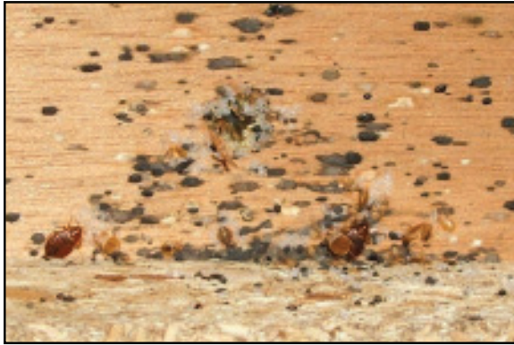
Heavy bed bug evidence on back of headboard.