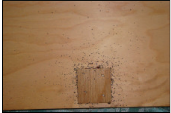
Heavy bed bug evidence on back of headboard.