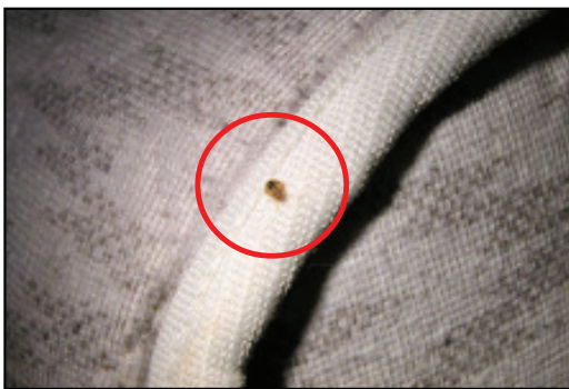
Adult bed bug on mattress seam.