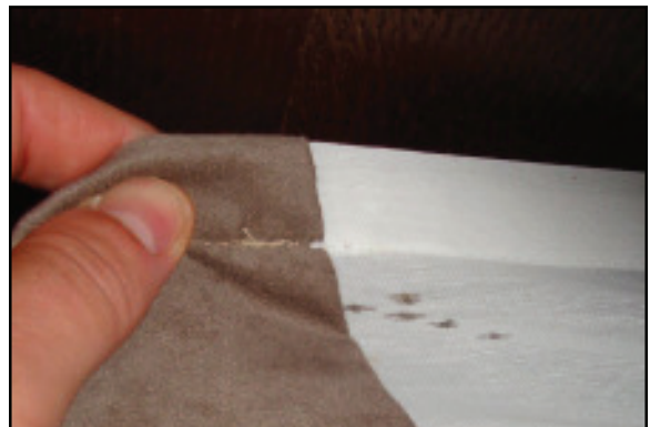
Blood spots left by bed bugs on a bed skirt.